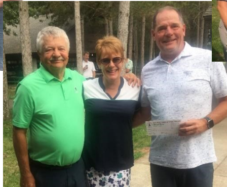
Shown are the top three teams!